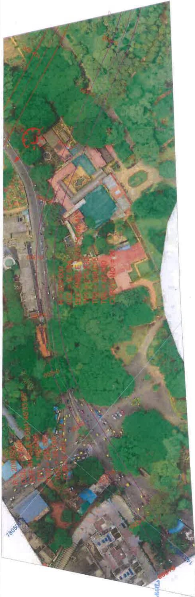
PLAN SCALE 1:1500