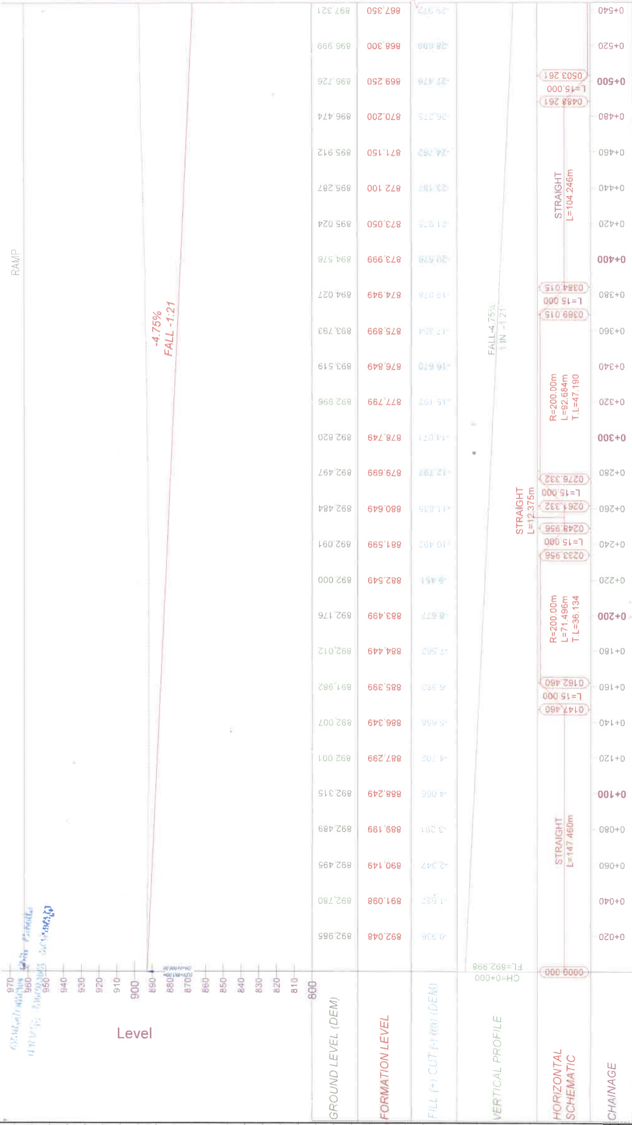
L-SECTION OF UPPERDECK ENTRY (LAL BAGH BOTANICAL GARDEN) SCALE 1:1500

NOTES - 1. ALL DIMENSIONS ARE IN MILLIMETERS AND ELEVATIONS IN METER UNLESS OTHERWISE SPECIFIED. 2. NO DIMENSIONS SHOULD BE MEASURED FROM DRAWING.