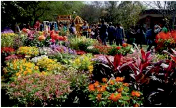
GARDEN OF FIVE SENSES