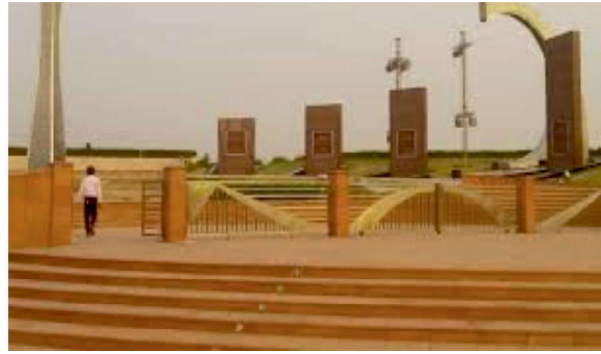
GURU TEG BAHADUR MEMORIAL