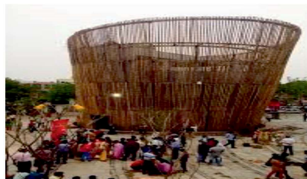
DILLI HAAT JANAKPURI